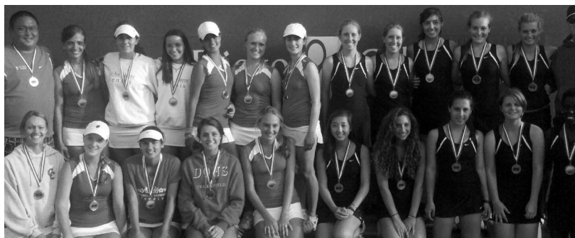
Alpha Flight: The Alpha Flight Champions Cathedral Catholic (Left) with Finalists La Jolla Country Day School

Be prepared for the Boy's "First Serve" Team Tennis event in the Spring of 2011!