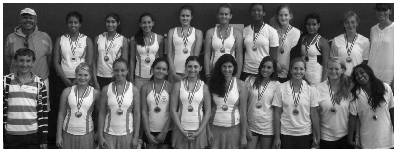
Beta Flight: The Beta Flight Finalists Valhalla (left) with Champions St. Josephs Academy