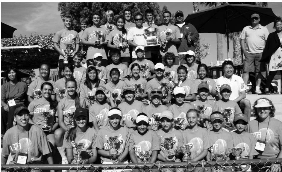
The Southern California Gar Glenney Cup Champions!