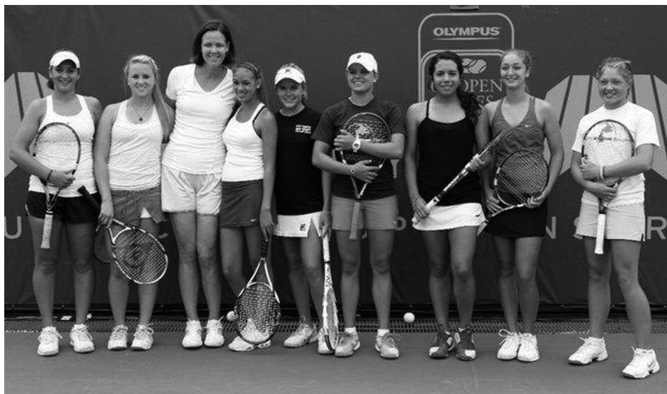
Juniors from the Girls' National Championships spent time on court with Lindsay Davenport at the Youth Tennis San Diego sponsored "Kid's Day" at the Mercury Open.

The event is being organized, staged and promoted by the USTA. Youth Tennis San Diego will host a Kid's Day Clinic on November 3rd from 4:00-6:30 p.m. at the Barnes Tennis Center. Pros from the Fed Cup Team will be on court to start off the event for kids. For more information, fans can call the U.S. Fed Cup hotline at (888) 334-8782 or visit www.usta.com/fedcup .